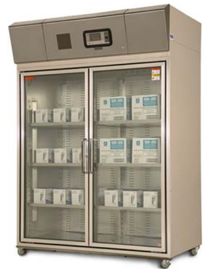
New double-door model